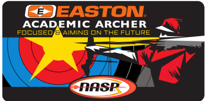
AA Decal and Patch